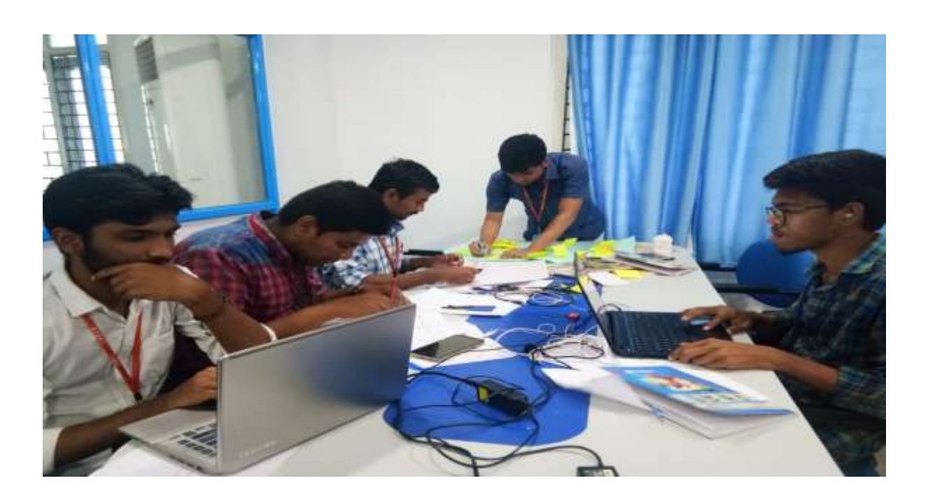
Our students with ISB team