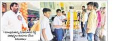
అంతర్జాతీయ సంవత్సరం సమయానికి తెలుగు సాహిత్య కేంద్రం, విద్యార్థులు