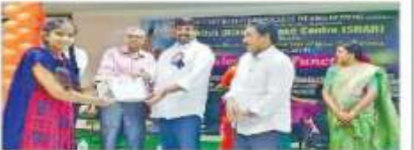
అంతర్జాతీయ సంవత్సరం సమయానికి తెలుగు సాహిత్య కేంద్రం, విద్యార్థులు

మైంథరం, మ్యానీయల్ డిజైనింగ్ వంటి ఆలోచనాత్మక విద్యార్థులు ఆలోచనలకు పదును పెట్టాలి. ఈ కార్యక్రమం ద్వారా విద్యార్థులకు అవకాశాలు కల్పించేందుకు అంతర్జాతీయ సంవత్సరం ఏర్పాటు చేయబడింది.