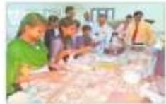
అంతర్జాతీయ సంవత్సరం సమయానికి తెలుగు సాహిత్య కేంద్రం, విద్యార్థులు