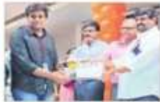
విద్యార్థులకు అవకాశాలు కల్పించేందుకు అంతర్జాతీయ సంవత్సరం

అంతర్జాతీయ సంవత్సరం ప్రాథమిక ప్రాంతాల విద్యార్థులకు అవకాశాల కల్పించేందుకు అంతర్జాతీయ సంవత్సరం ఏర్పాటు చేయబడింది. ఈ కార్యక్రమం ద్వారా విద్యార్థులకు అవకాశాలు కల్పించేందుకు అంతర్జాతీయ సంవత్సరం ఏర్పాటు చేయబడింది. ఈ కార్యక్రమం ద్వారా విద్యార్థులకు అవకాశాలు కల్పించేందుకు అంతర్జాతీయ సంవత్సరం ఏర్పాటు చేయబడింది.