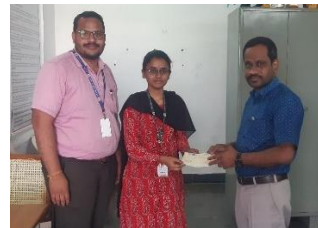
Scholarship to Students