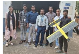
Student Workshop & Competitions