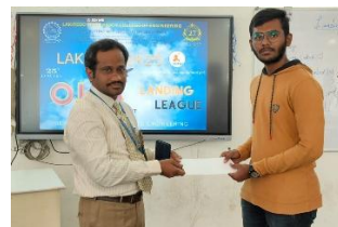
Student Winners in Lakshya 2K25