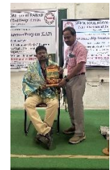
Facilitation to Deputy Director, CITD-Vijayawada