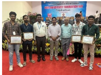
Awards form JNTUK