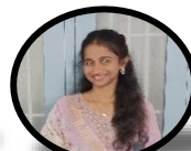
Muni Sushma Swaraj