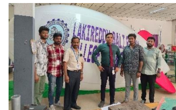
Airship - Student Project