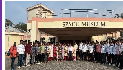
Industrial Visit to SDSC-SHAR