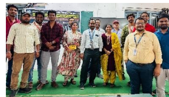
Alumni Meet 2025