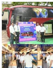
Anthriksha Ratha Yatra Day