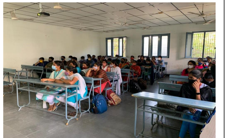
Participants attending Expert Lecture