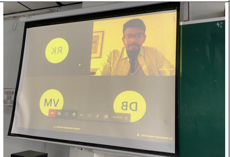
Resource Person Delivering Lecture