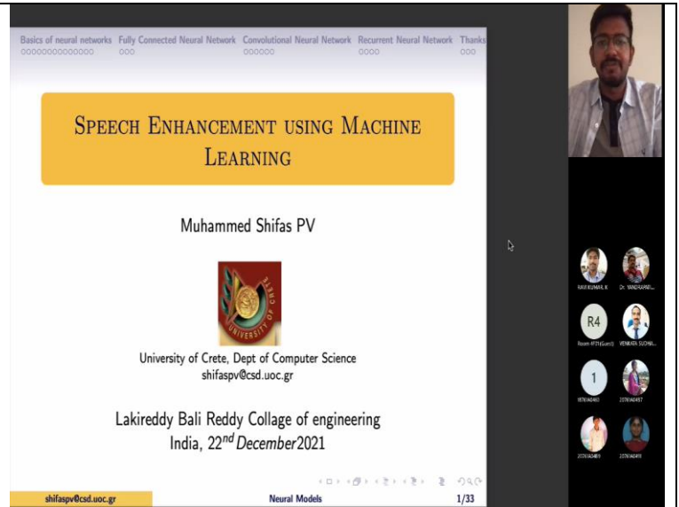
Starting of Session by Resource Person Muhammed Shifas PV