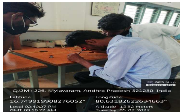
Students implementing the circuit designed in software using hardware