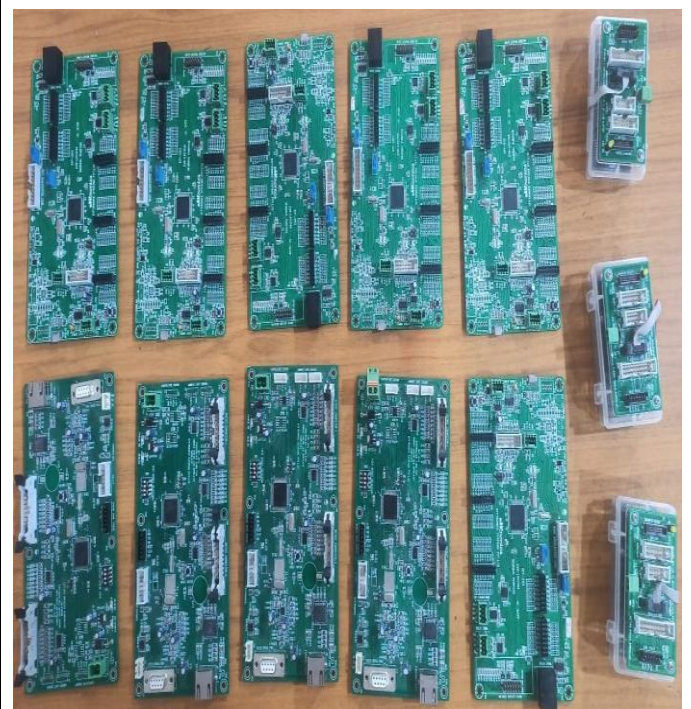
Kits used for training Program