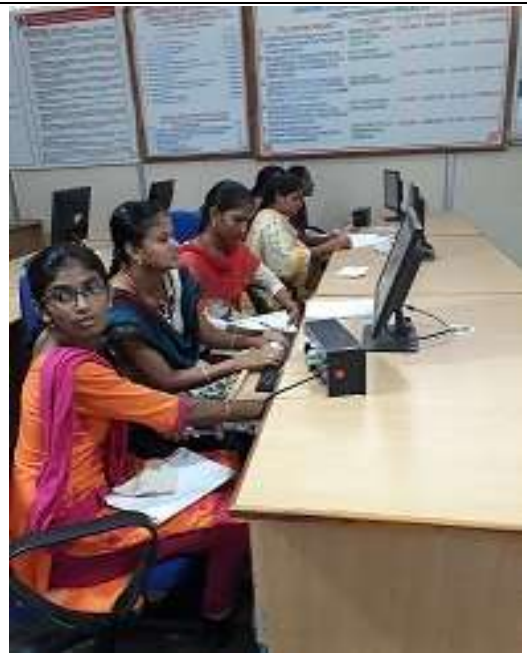
Hands on Session