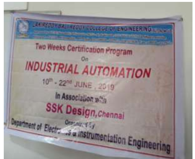
Poster for the Certification Program