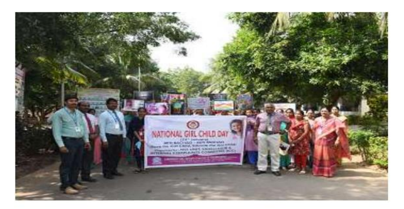
Students' participation in a rally on National Girl Child Day-2020