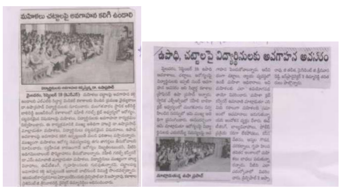
One-Day Seminar on "Health and Legal Issues" was organized by SAHELI- Girls' Club for all girl students and women staff on 19<sup>th</sup> September 2017.