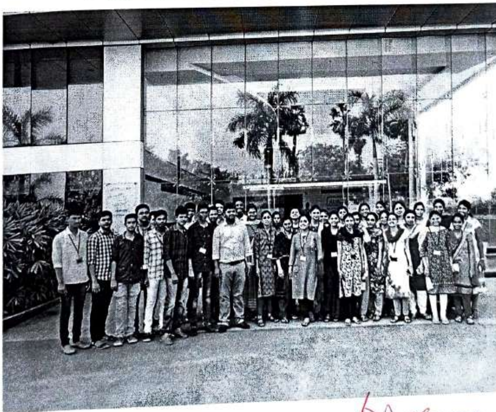
Head of the Department Department of Information Technology Lakireddy Bah Reddy College of Engineering MYLAVARAM-521 230, Krishna Dt., A.P., INDIA