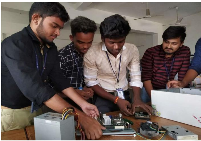
Students Participation in CPU Assembling