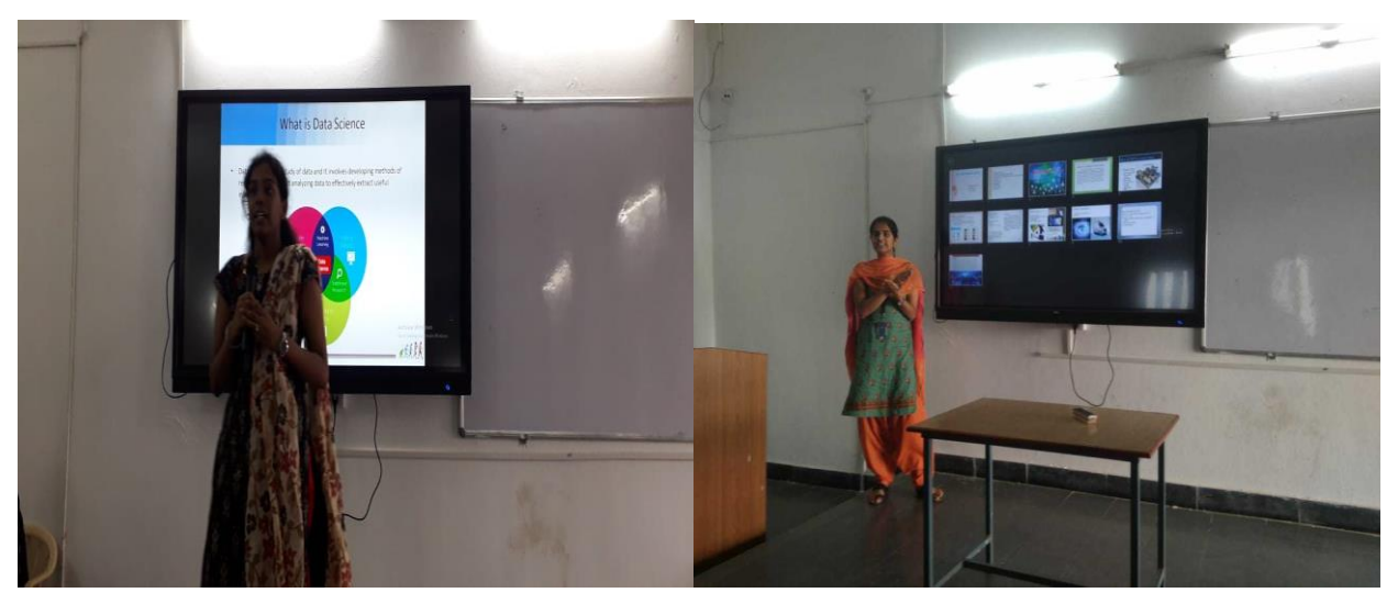
PPT presentation by Students