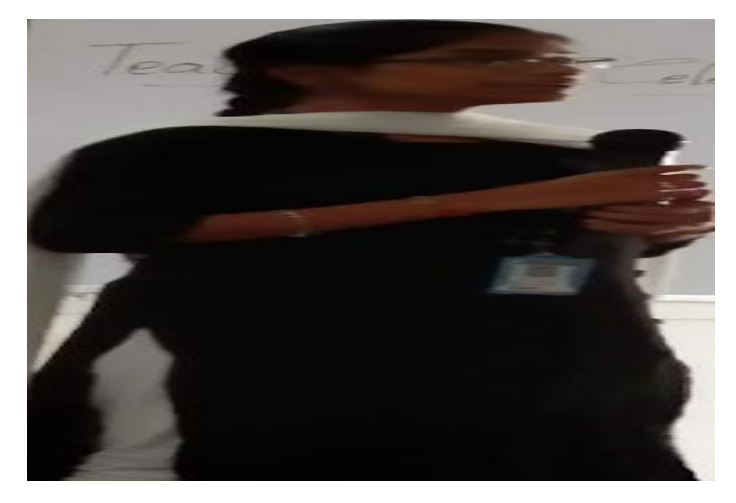
Motivational talk by IV year Students