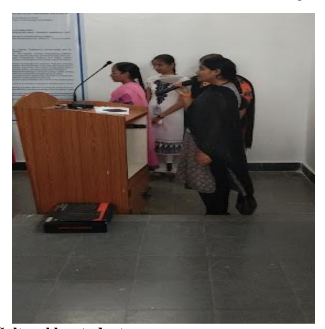
Cultural by students