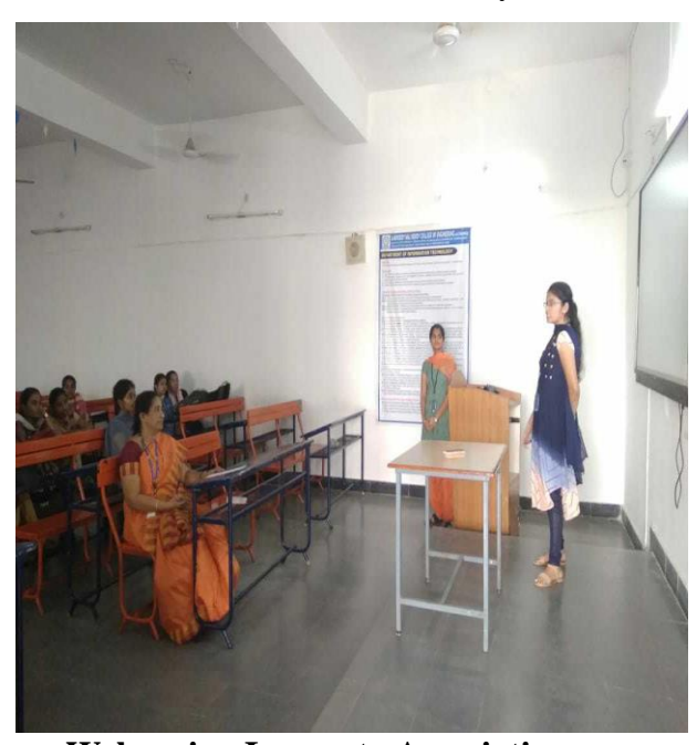
Welcoming I years to Association