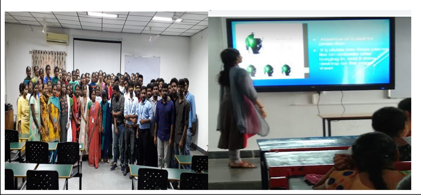
Students participated in Association