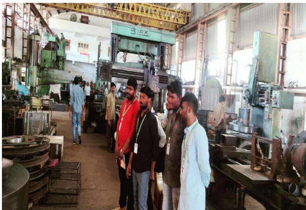
B.Tech-III Semester A section students watching the drilling process at Machine shop