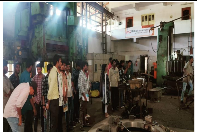
B.Tech-III Semester A section students watching the castings made and showing to the students