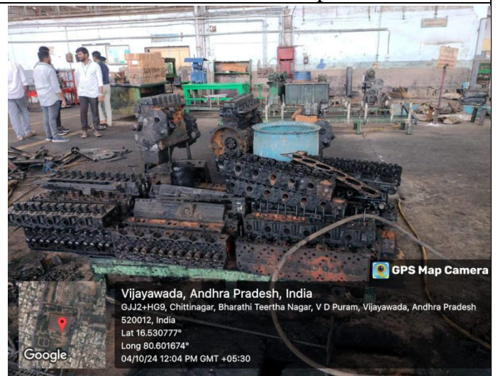
Students observing the IC engine components displayed in the APSRTC ZONAL workshop