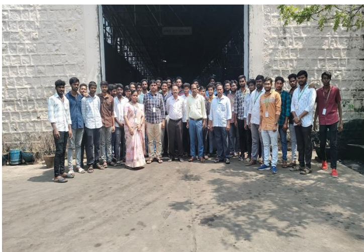
Students taking a photograph with APSRTC ZONAL workshop Officials and Staff