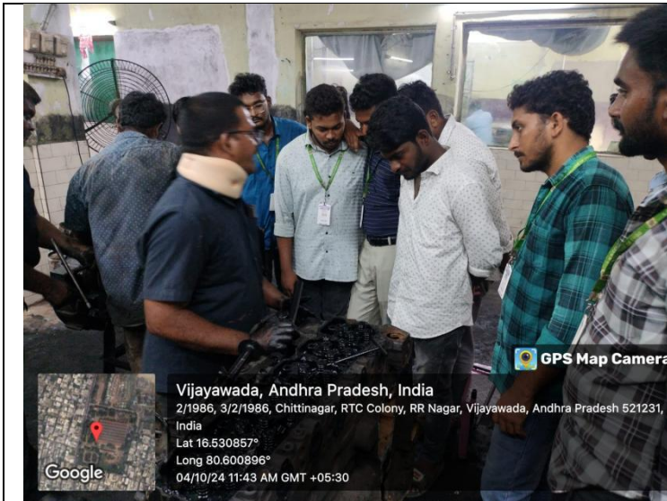
Students listening to the instructor in the APSRTC ZONAL workshop