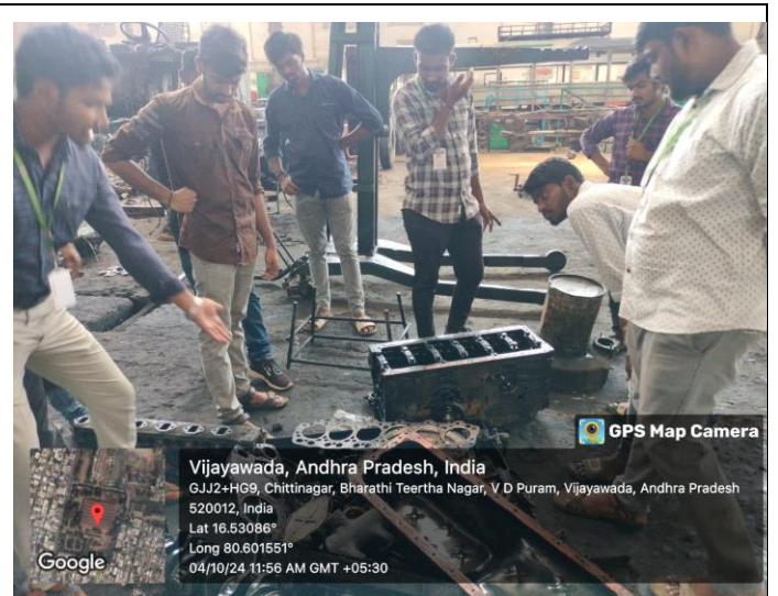
Students observing the cylinder head and other parts explained by to the instructor in the APSRTC ZONAL workshop