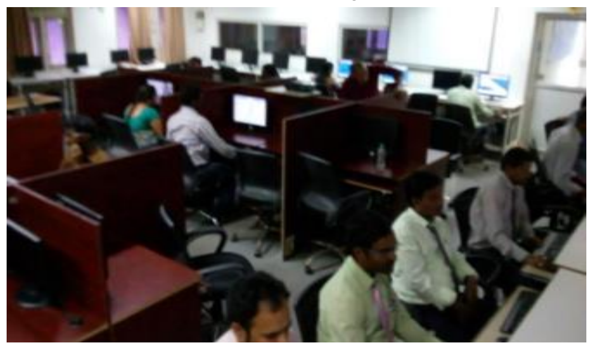
Practice session of 3D assembly by faculty participants