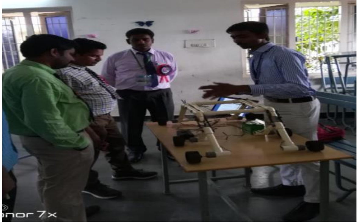
Faculty Incharges evaluating the event NIPUNA-the project expo