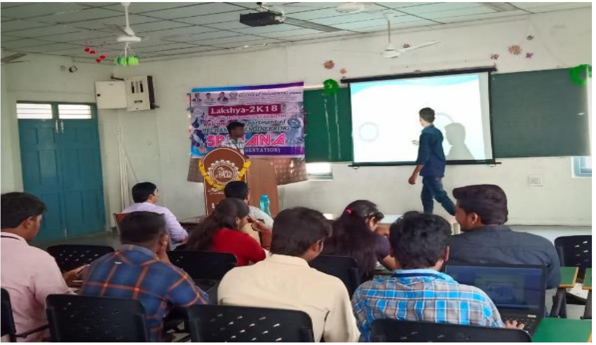
Students given presentation in SRUJANA paper presentation competition

• The Department of Mechanical Engineering actively participated in LAKSHYA-2018 a National level technical symposium conducted by Lakireddy Bali Reddy College of Engineering on 27-12-2018.