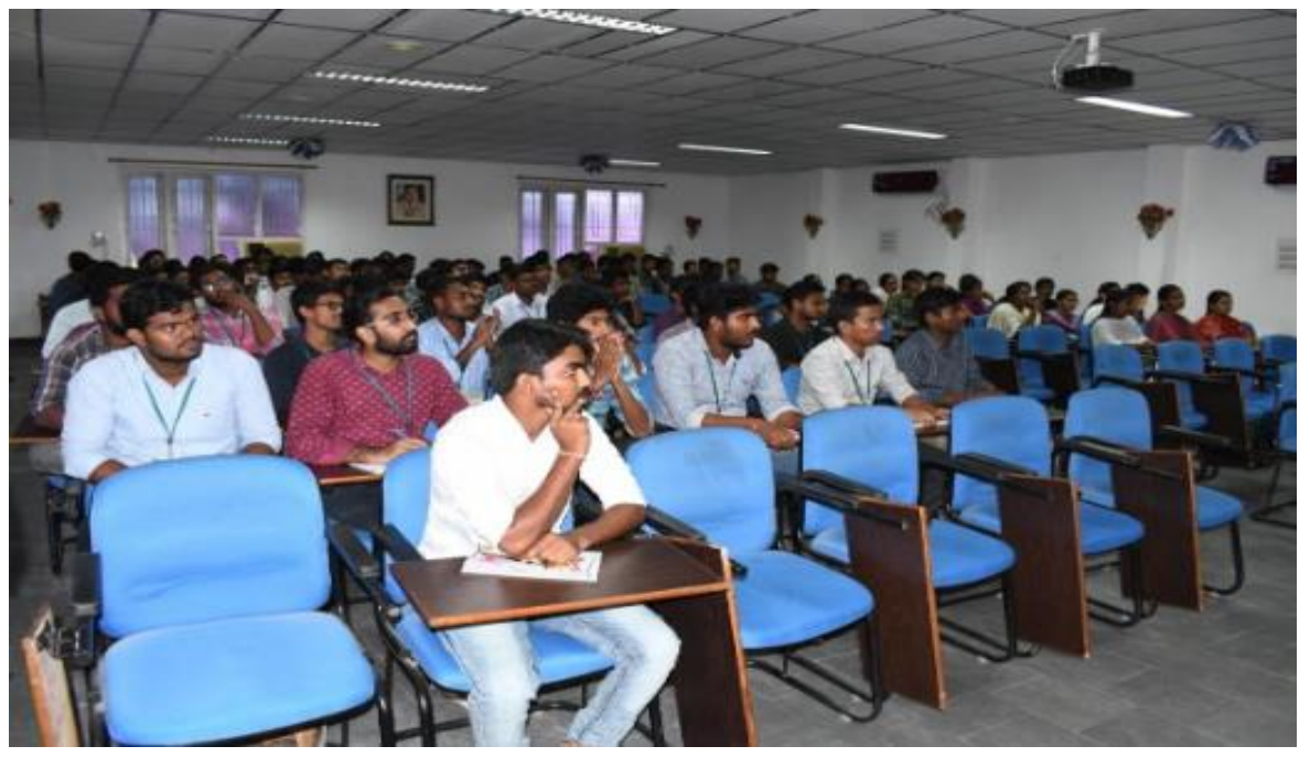
Student participants in guest lecture