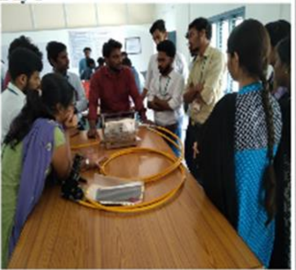
Practical sessions: (by M.Vinay.) Giving practical exposure on UV Test (Radio Graph Testing) to students and how to identify the defects on welded plates and casing pipes and casing tubes.