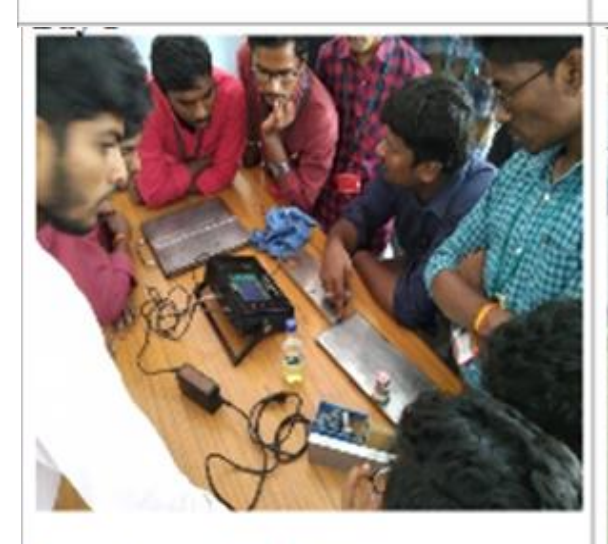
Practical sessions: (by B.Ravi Teja) Giving practical exposure on UV Test (ultra violet testing) to students and how to identify the defects on welded plates.