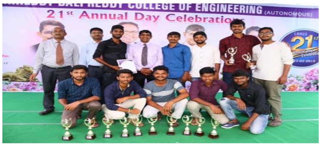
Mechanical Engineering students received prizes in sports by Management and Principal

• The department of Mechanical Engineering actively participated in 21<sup>st</sup> Annual day celebrations on 23.02.2019.