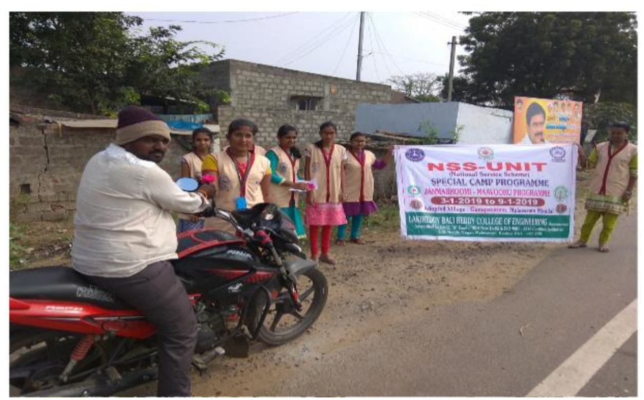
NSS volunteers create awareness on usage of Helmet