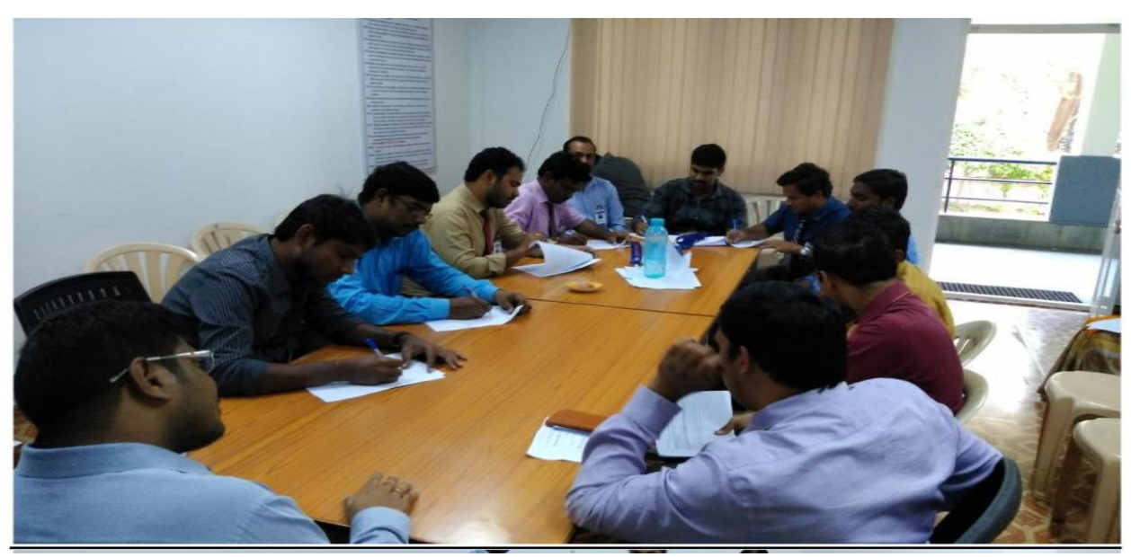
Feedback given by Alumni members