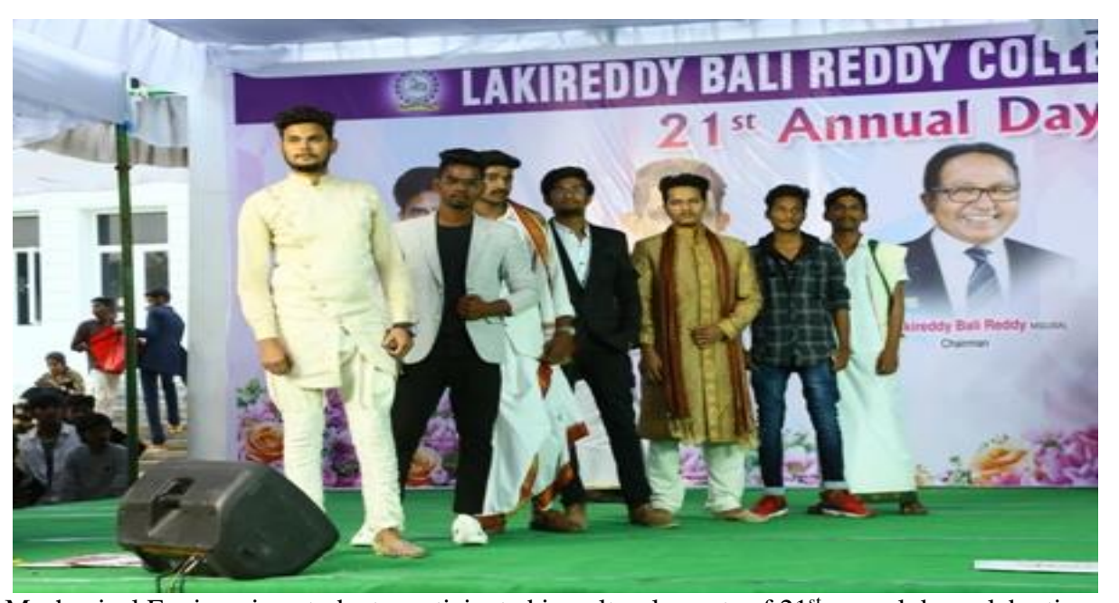
Mechanical Engineering students participated in cultural events of 21st annual day celebrations