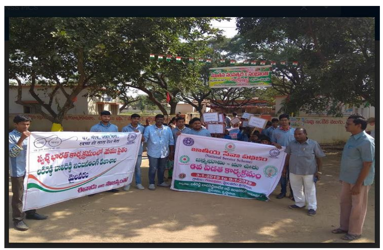
NSS volunteers rally on plantation of trees

• The following are the list of Volunteers participated in Mahasivarathri celebrations in March-2019 at Velvadam.