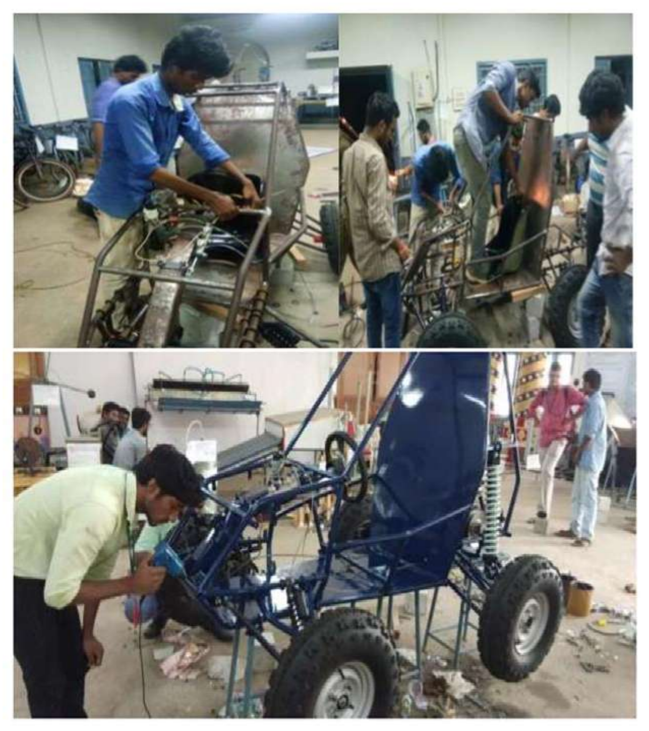
Fabrication of All Terrain Vehicle (ATR) by students