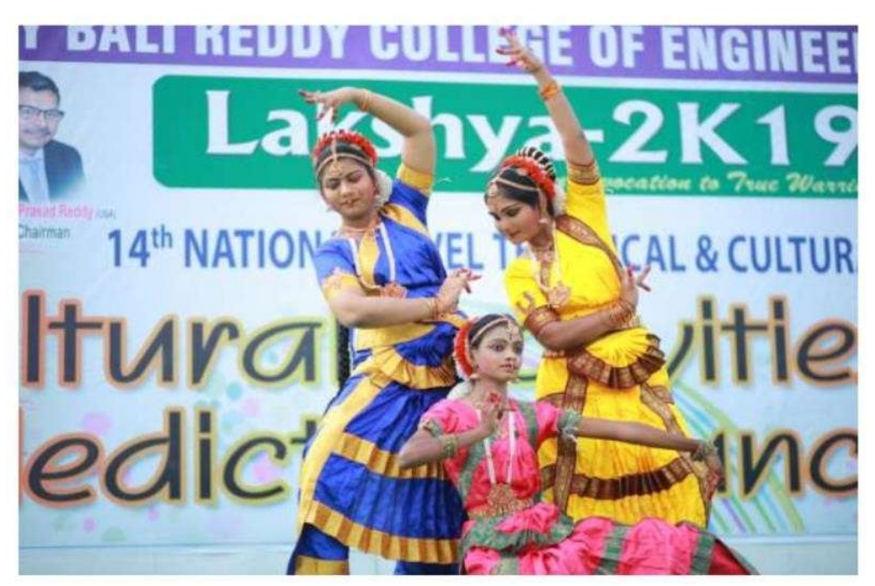
Cultural events in Lakshya-2019