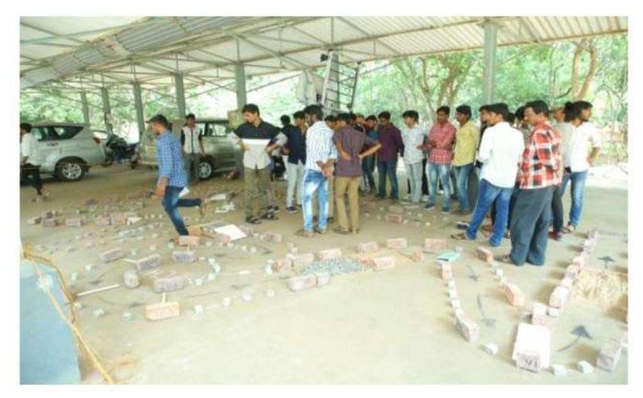
Students Participated in Yantrora Event