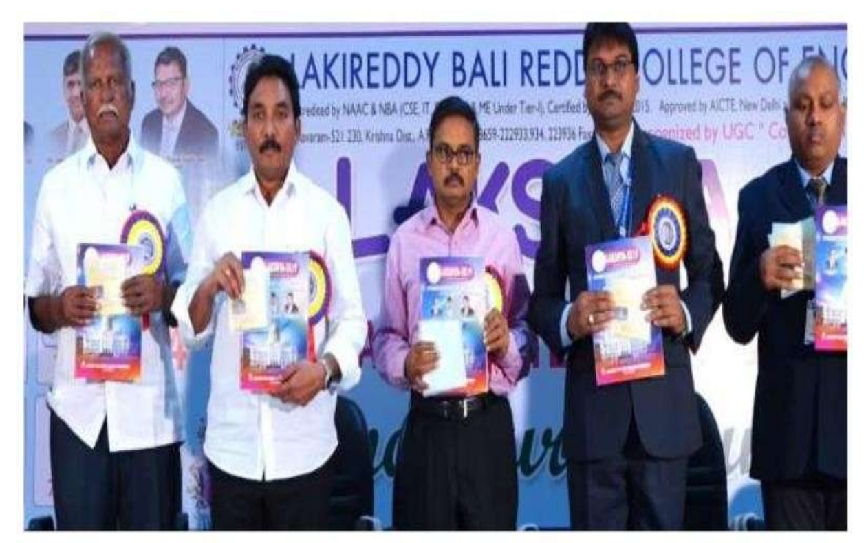
Inaguration of Lakshya-2019