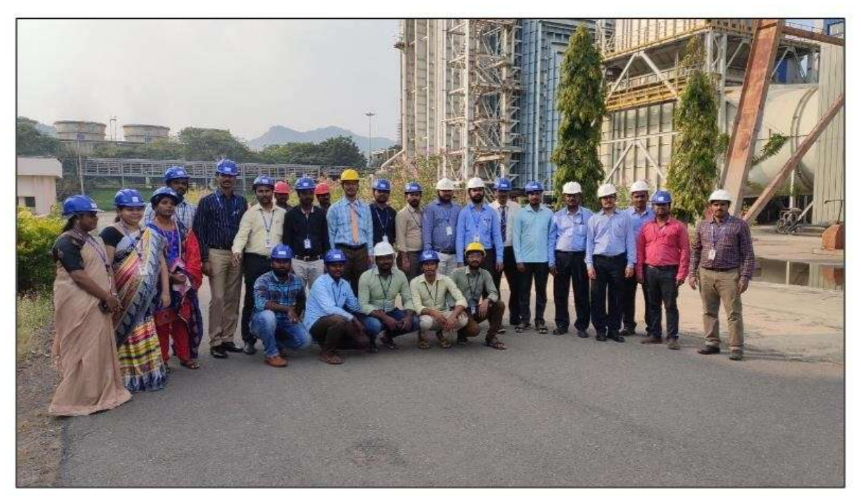
Participants visited Lanco Industrial Plant, Kondapalli