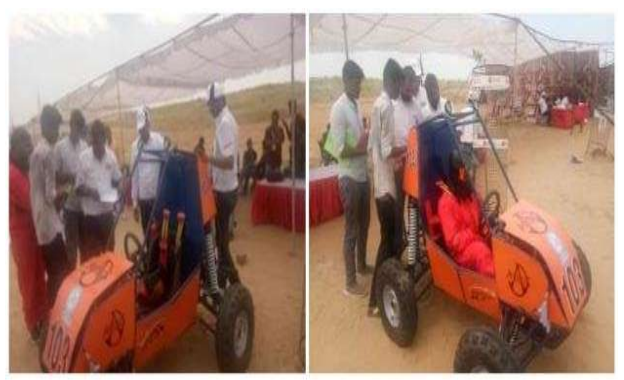
Participation of All Terrain Vehicle (ATR) in RCDC 2019 at Bikaner, Rajasthan