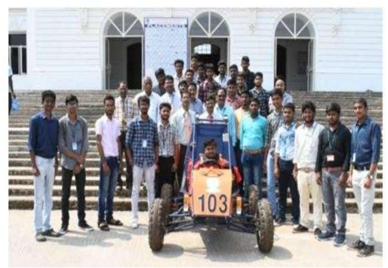
Final model of All Terrain Vehicle (ATR) with Management, Principal, HoD and students