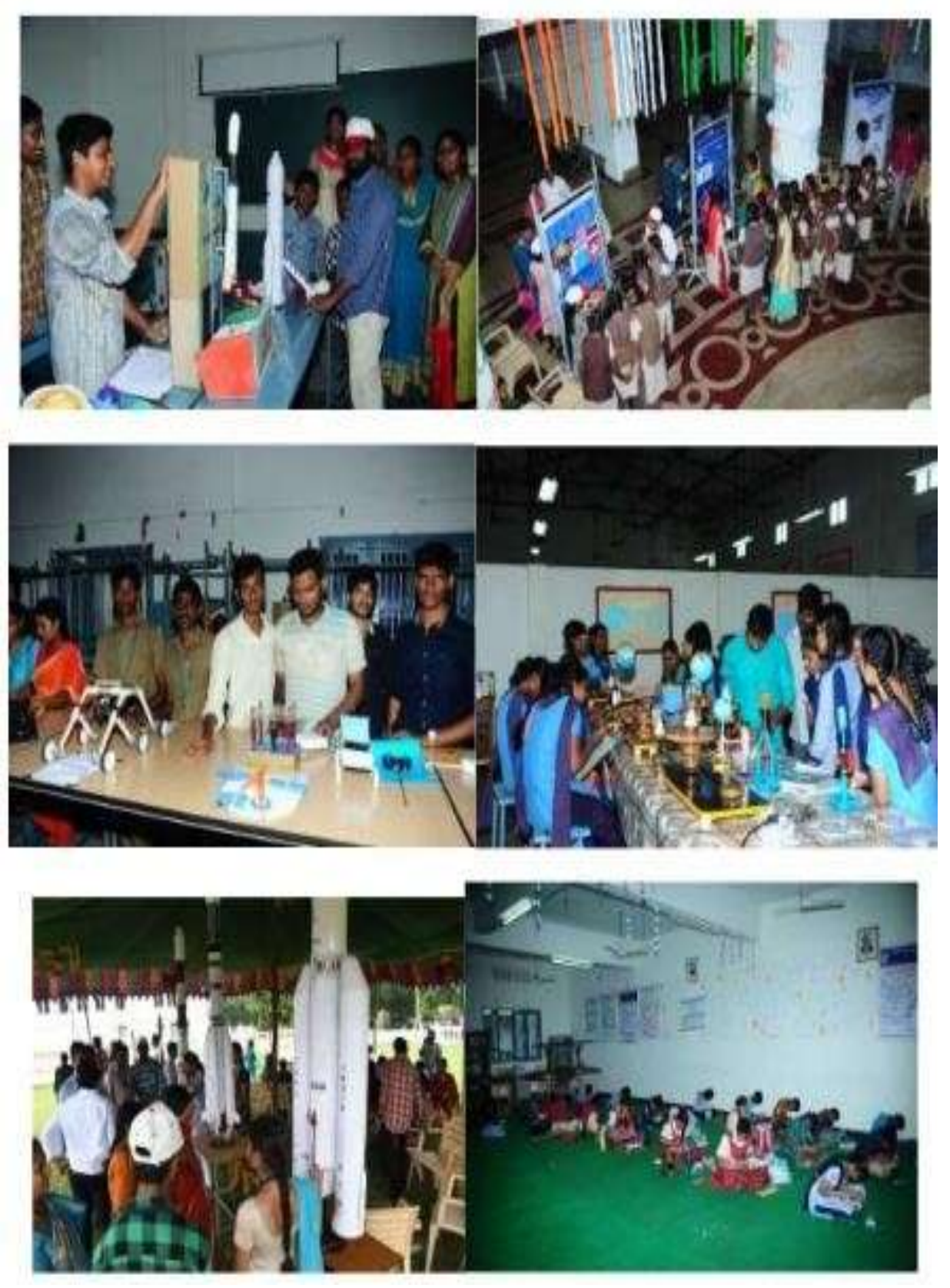
Students participated various events organized in World Space Week